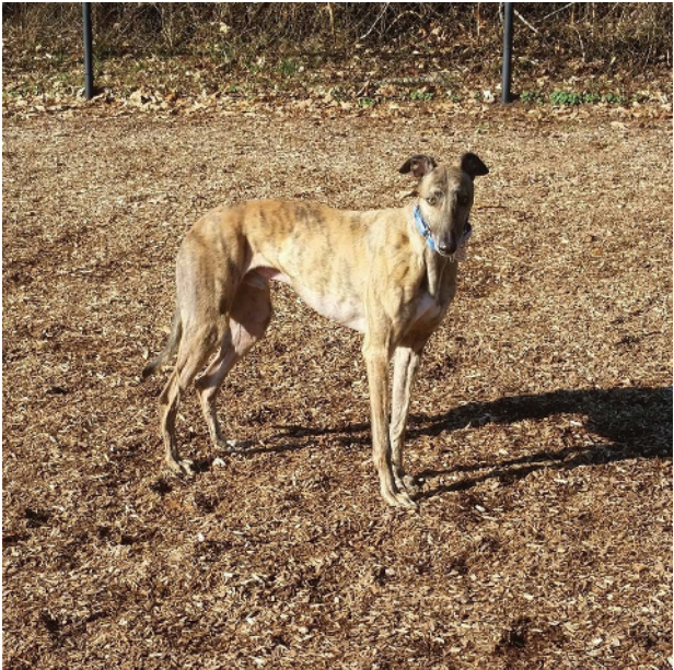
Figure 1.3 The Greyhound is an example of a hound group dog breed.

The hound group shares the common traits used for hunting (Figure 1.3). Some dogs have acute senses, such as smell, hearing, and sight. Others demonstrate relentless stamina as if they will run forever. The hound group is diverse, with sight hounds that are slim and built for speed and foxhounds and bloodhounds that are larger boned and built for tracking and hunting. Some hounds share the distinct ability to produce a unique barking or baying sound. Many dogs within the hound group have floppy to drooping ears.