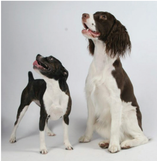
Figure 1.1 Small breed dogs have a longer average life expectancy than large and giant breeds. The larger the dog breed, the shorter the life span.

the family. Herding dogs are among the most intelligent, making excellent companions, and also obedience and agility dogs. Herding breeds are high in energy and bond strongly to their human companions.