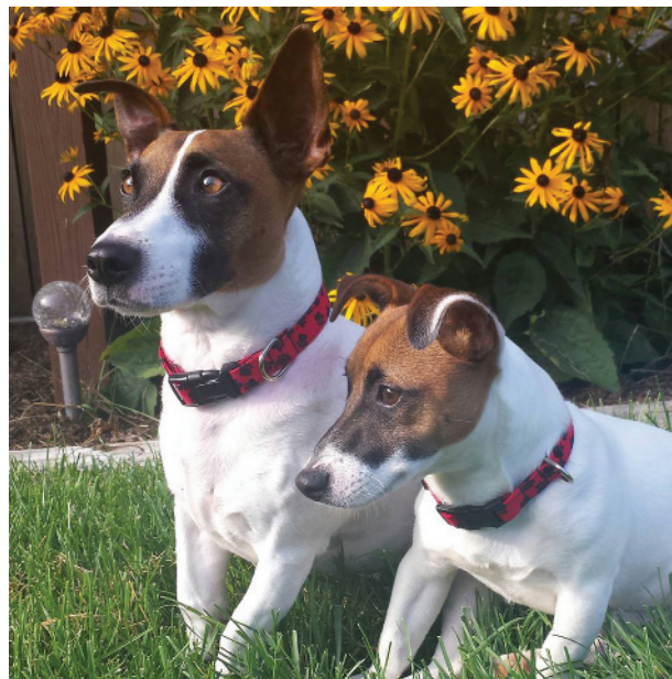
Figure 1.6 The Parson Russell Terrier is an example of a terrier group dog breed.

show obedience and agility. Sporting dogs require regular exercise and activity and human attention. The sporting group breeds include the Retrievers, Spaniels, Pointers and Setters.