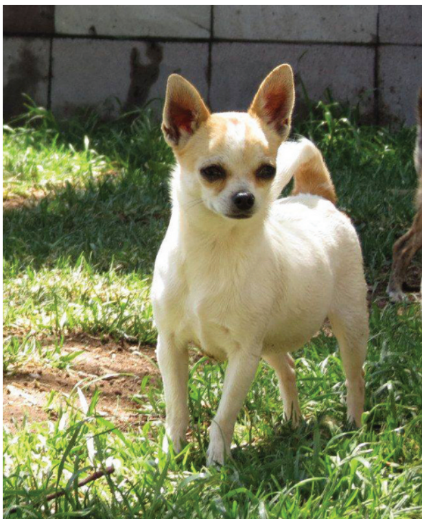
Figure 1.7 The Chihuahua is an example of a toy group dog breed.