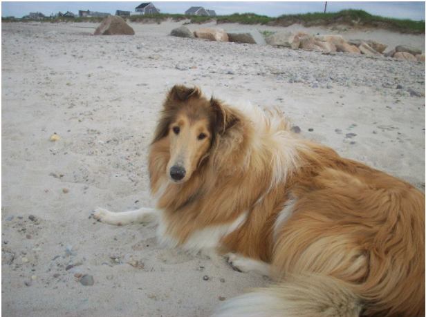
Figure 1.2 The Collie is an example of a herding group dog breed.

The hound group shares the common traits used for hunting (Figure 1.3). Some dogs have acute senses, such as smell, hearing, and sight. Others demonstrate relentless stamina as if they will run forever. The hound group is diverse, with sight hounds that are slim and built for speed and foxhounds and bloodhounds that are larger boned and built for tracking and hunting. Some hounds share the distinct ability to produce a unique barking or baying sound. Many dogs within the hound group have floppy to drooping ears.