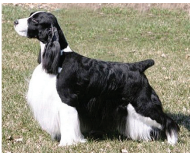
Figure 1.5 The English Springer Spaniel is an example of a sporting group dog breed.

The sporting group is naturally active, alert, and honest companion dogs used in many types of hunting sports (Figure 1.5). Known for their instincts in water and woods, many of these breeds actively continue to participate in hunting and field trial activities, and also